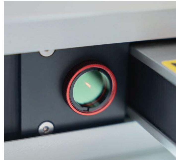
Magnetic suction design, cleaning and changing mirrors is more convenient