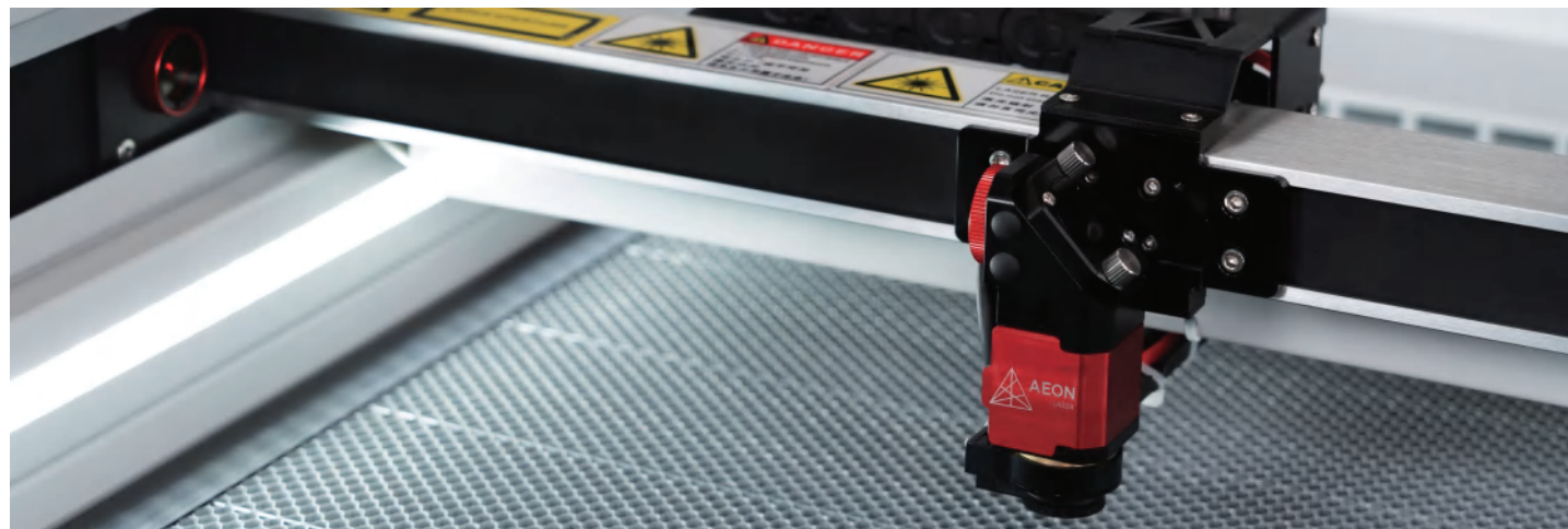
Whole optical path and guide rail clean pack design.